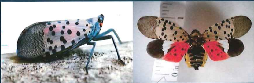
Adult Spotted Lanternfly, present in autumn months.

If you find any of these life stages of the Spotted Lanternfly, remove, devitalize, place in a sealed bag, and dispose of bag in the garbage.